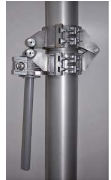
Column Double clamp device