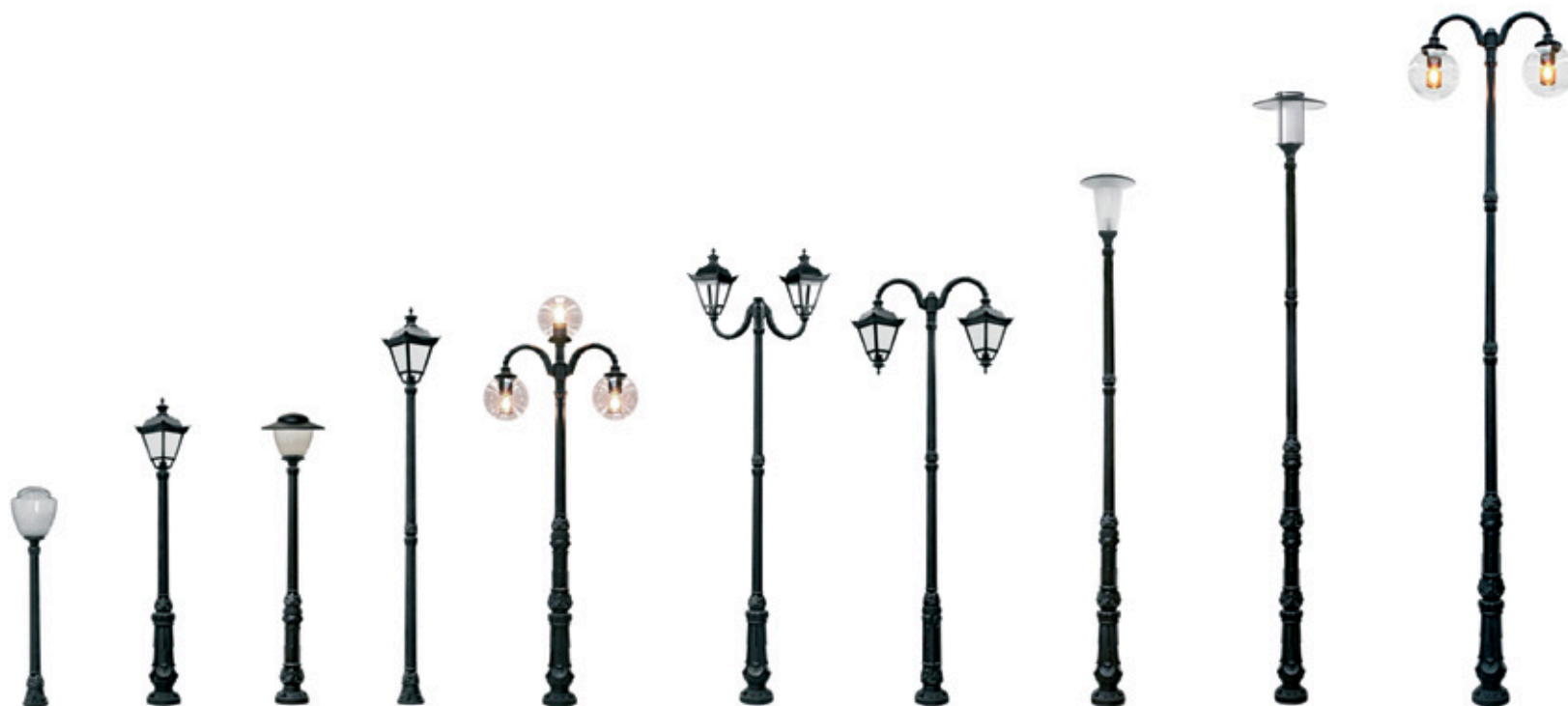
Pole S-13/B luminaire OP, lamp diffuser Klio white