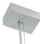
Electrical suspension Pieces in set: 1