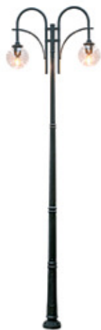
Pole SP-4W/E Extension arm WTM-11/2 luminaires OP lamp diffusers Sphere transparent Ø400 stainless steel louvre reflectors