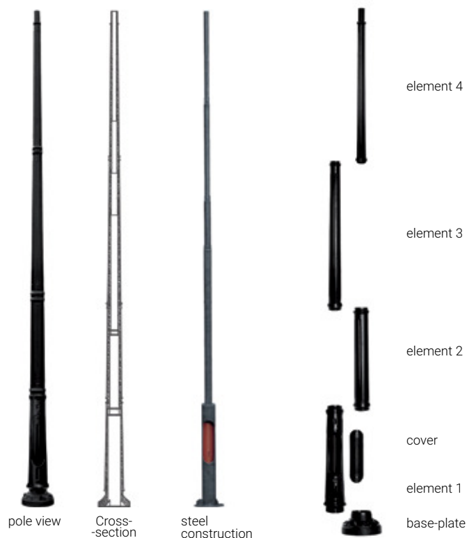
Example of the pole construction SP-4W