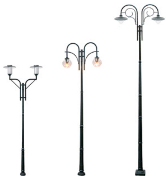
Pole SP-3W/A Extension arm WT-5/2 Luminaires ELBA LED