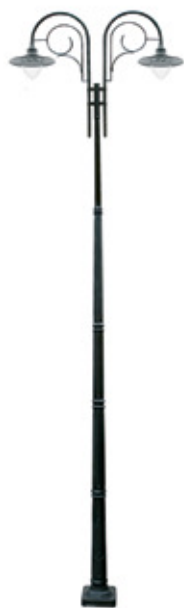
Pole SP-5W/E Extension arm WTM-20/2 luminaires OW LED transparent lamp diffuser